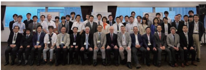
Sendai Conference 2018

Professor, Department of Multiple Sclerosis Therapeutics, Fukushima Medical University Research Institute for Neuroscience